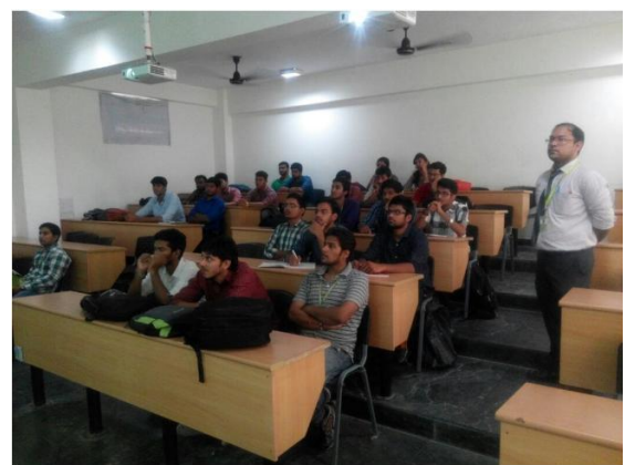
Participants during the Workshop